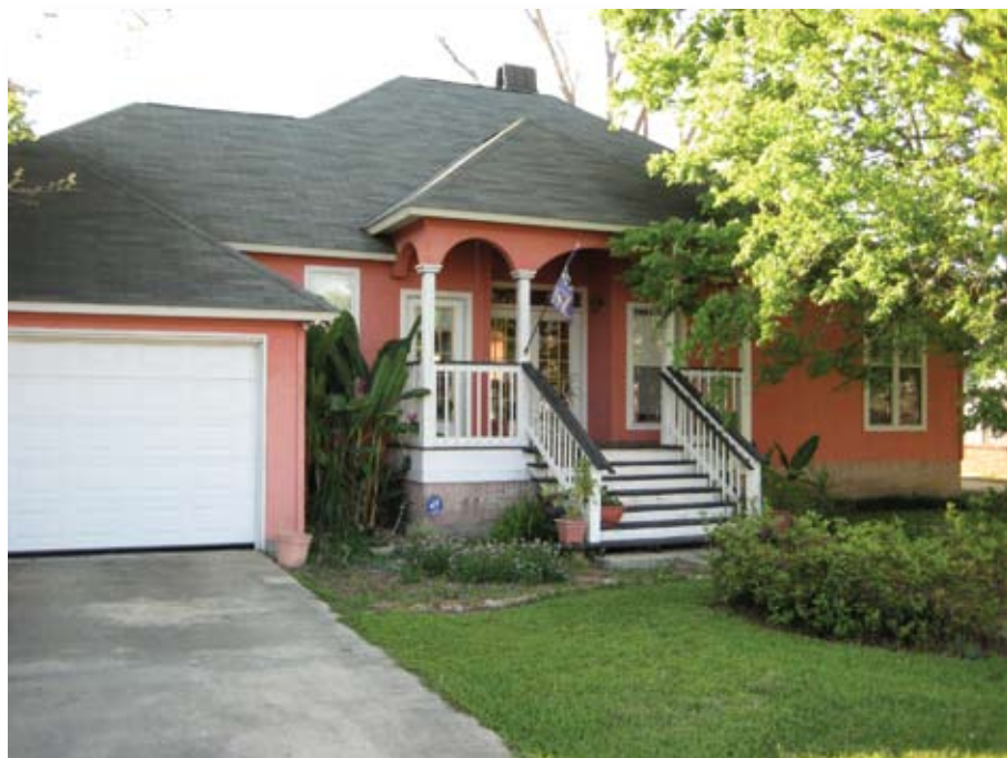
Raised floor home in Baton Rouge

In contrast, if the floor finish was vinyl, the vapor retardant paint applied over open cell foam appeared to result in lower subfloor moisture contents on average (relative to an otherwise identical floor system with the vapor retardant paint omitted), but some individual moisture readings still exceeded 16 percent moisture content. The data regarding the effect of vapor retardant paint were not conclusive, and further research is needed to determine whether the combination of open cell foam and vapor retardant paint can be a reliable strategy for preventing summertime moisture accumulation in subfloors in this climate.