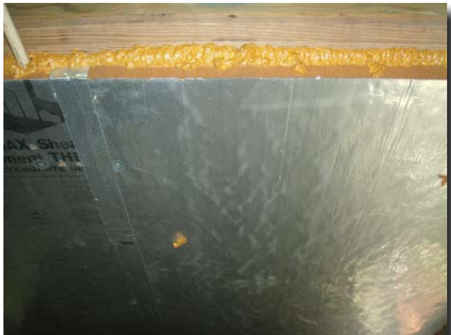
Figure 4a. Example of rigid, foil-faced polyisocyanurate foam.

Air temperature and humidity were measured with data loggers placed indoors, outdoors and in crawl spaces. Moisture content and temperature of the wood or plywood subfloor was measured, typically twice each month. Monitoring started in October 2008 and concluded in October 2009.